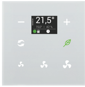
The picture of device is illustrative, the icons (symbols) are configurable by the customer.

EAN code GRT3-50/B: 8595188156301 GRT3-50/W: 8595188156349